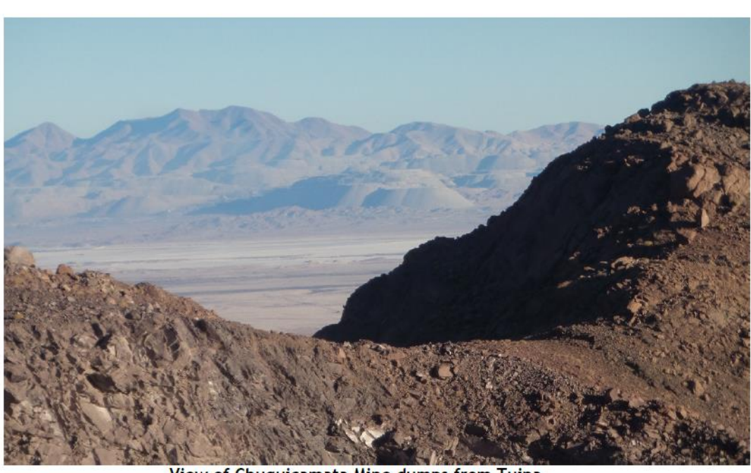
View of Chuquicamata Mine dumps from Tuina