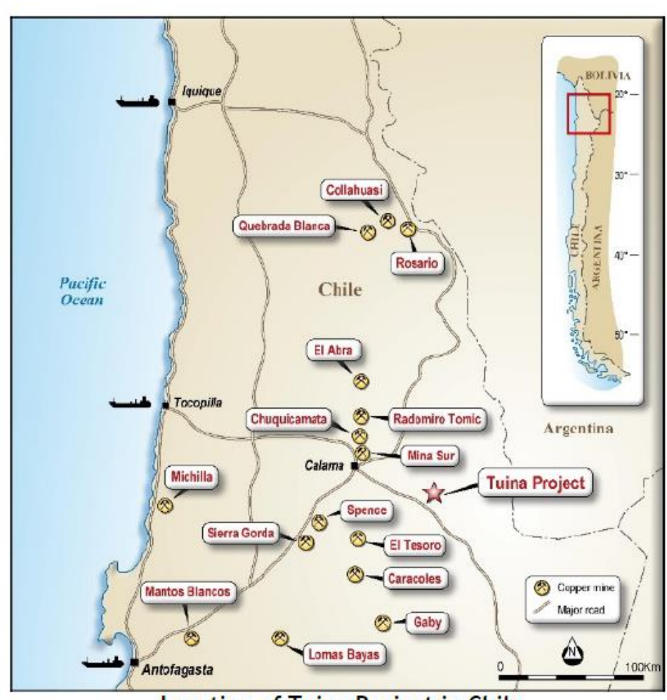
Location of Tuina Project in Chile