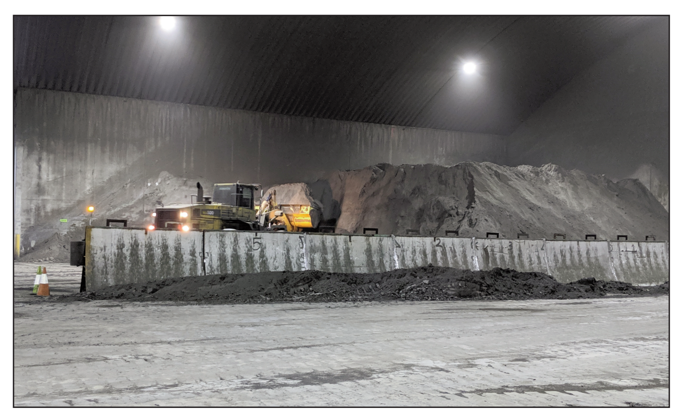
Figure 6: Zinc Concentrate loading at Gateway facility at Port Kembla