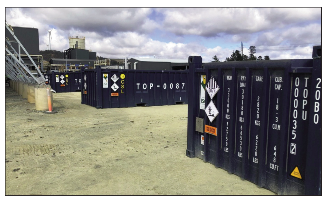
Figure 4: Zinc containers being loaded ready for the train to Port Kembla