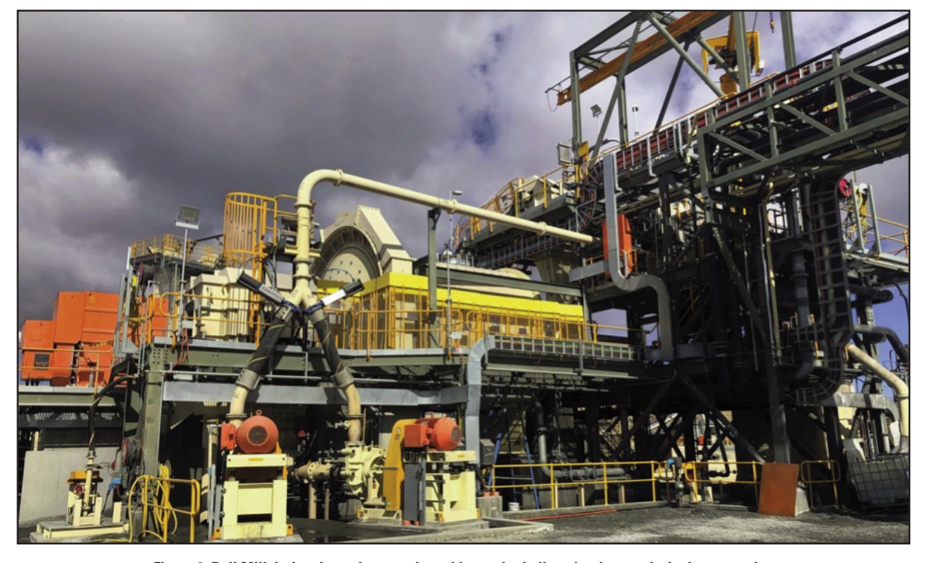
Figure 3: Ball Mill during the underground crushing and grinding circuit commissioning campaign