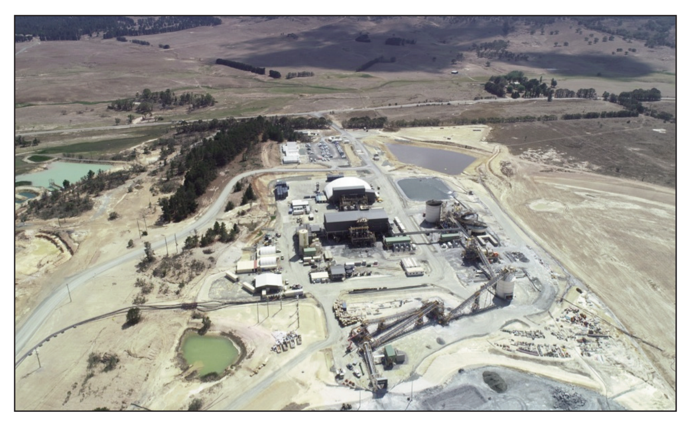
Figure 2: Woodlawn Processing Plant, with ROM Pad, crusher and fine ore bin in the foreground