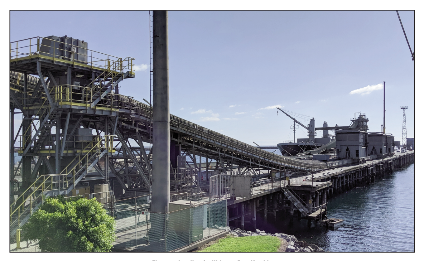
Figure 7: Loading facilities at Port Kembla