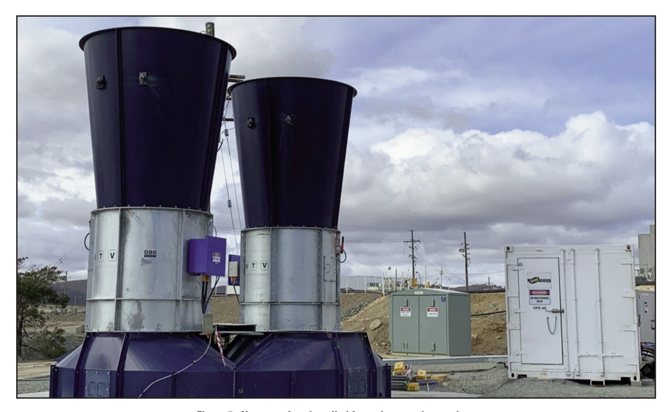
Figure 5: New vent fans installed for underground operations