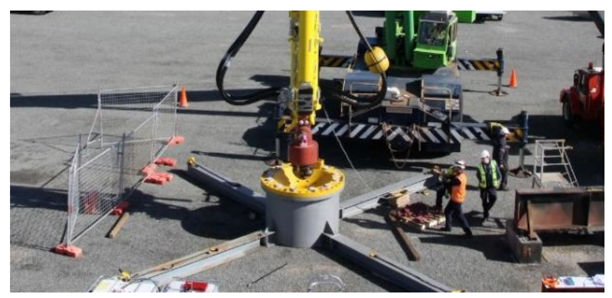
The SRP designed CETO 5 connector (red component in centre) during onshore testing, 2015

During the quarter, one of the Projects that Carnegie is participating in to develop non-core technologies was awarded grant funding. Wave Energy Scotland (WES) recently awarded funding to Subsea Riser Product's (SRP) Rocksteady WEC Mooring and Electrical Connection Project which Carnegie is a paid participant and aims to demonstrate the feasibility of a variant of one of Subsea Riser Products' connector for wave energy converters. SRP supplied connectors for the CETO 5 array.