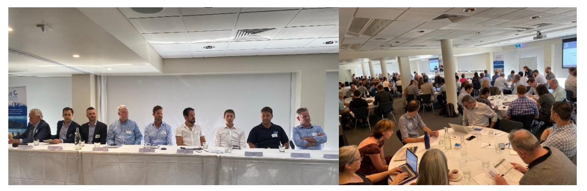
Blue Economy CRC Participant Workshop: Carnegie's CEO on the international expert panel (left); 140 participants in workshop mode in the Hobart Convention Centre (right)

During the quarter, Carnegie also received $865k from ARENA as the final payment for the previous CETO 6 Project.