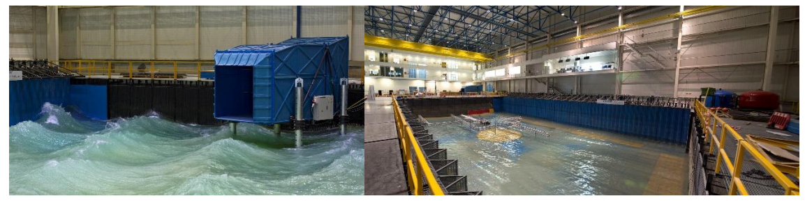
The wave tank in Cantabria, Spain

Carnegie was pleased to be awarded 2 weeks of wave tank testing at the Cantabria Coastal and Ocean Basin in Spain, funded through the European funded Marinet2 program which provides transnational access to key infrastructure across Europe in order to support the research, development and testing of Offshore Renewable Energy systems. This is Carnegie's third successful application to the Marinet program. Carnegie's funded tank testing program, expected to take place in approximately April-May, is an important step in the ongoing machine learning activities outlined in the Prospectus. The award of this free access allows Carnegie to complete this key task at a significantly reduced cost.