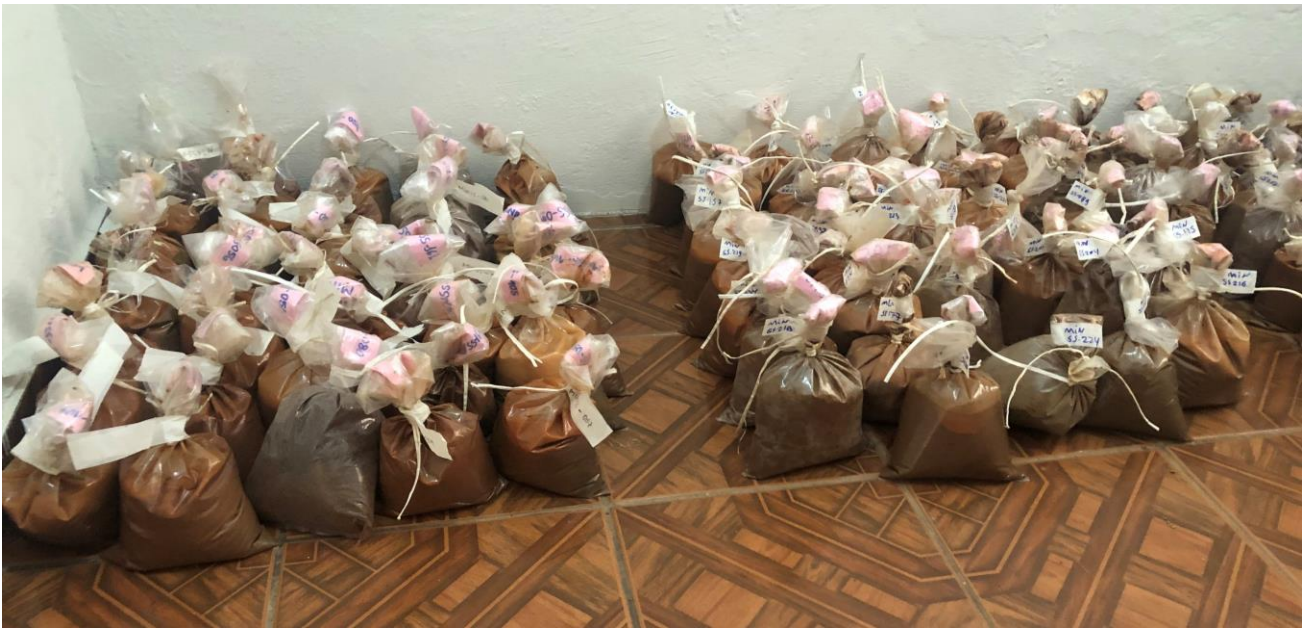
Figure 3: Minas Novas stream sediment samples ready to be dispatched for analysis