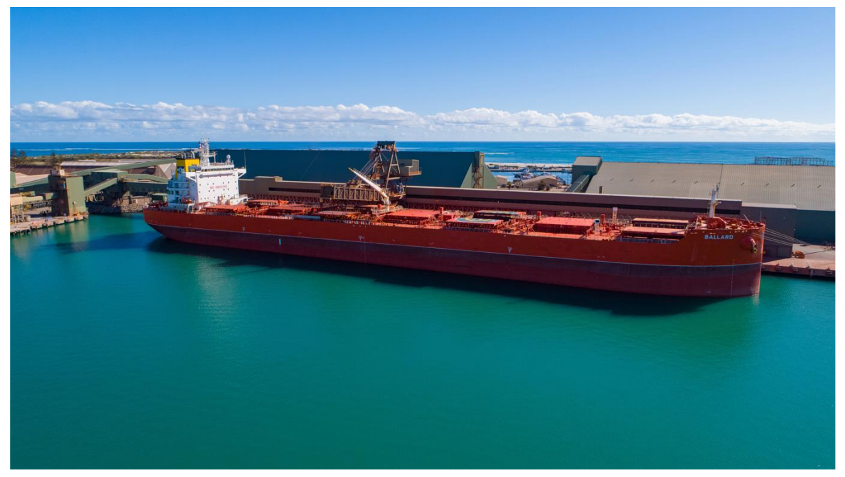
MV Ballard - Twin Peaks maiden shipment from Fenix's Geraldton Port facilities

Fenix Resources Limited (ASX:FEX) ( Fenix or the Company ) is pleased to announce that the first 59,275 tonnes of +60% Fe lump iron ore product ( Fenix TP Lump ) has been hauled, loaded and shipped from the high-grade Twin Peaks Direct Shipping Iron Ore Project ( Twin Peaks ).