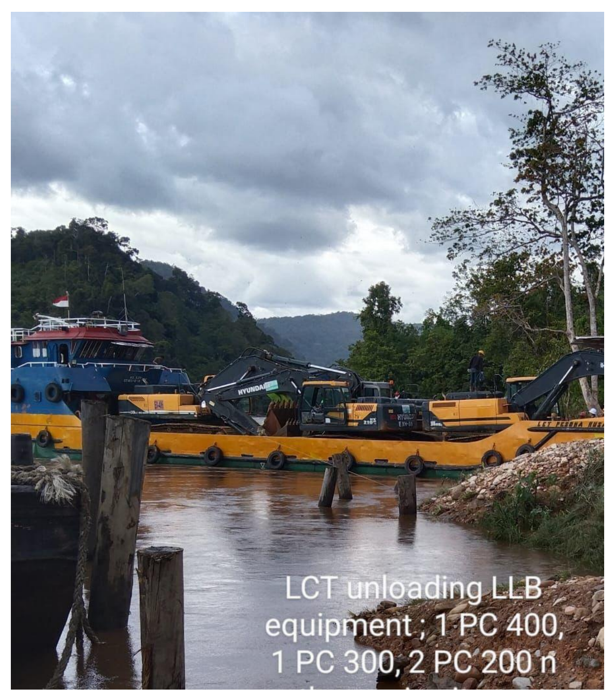
New contractor's mining equipment arriving at the Batu Tuhup Jetty