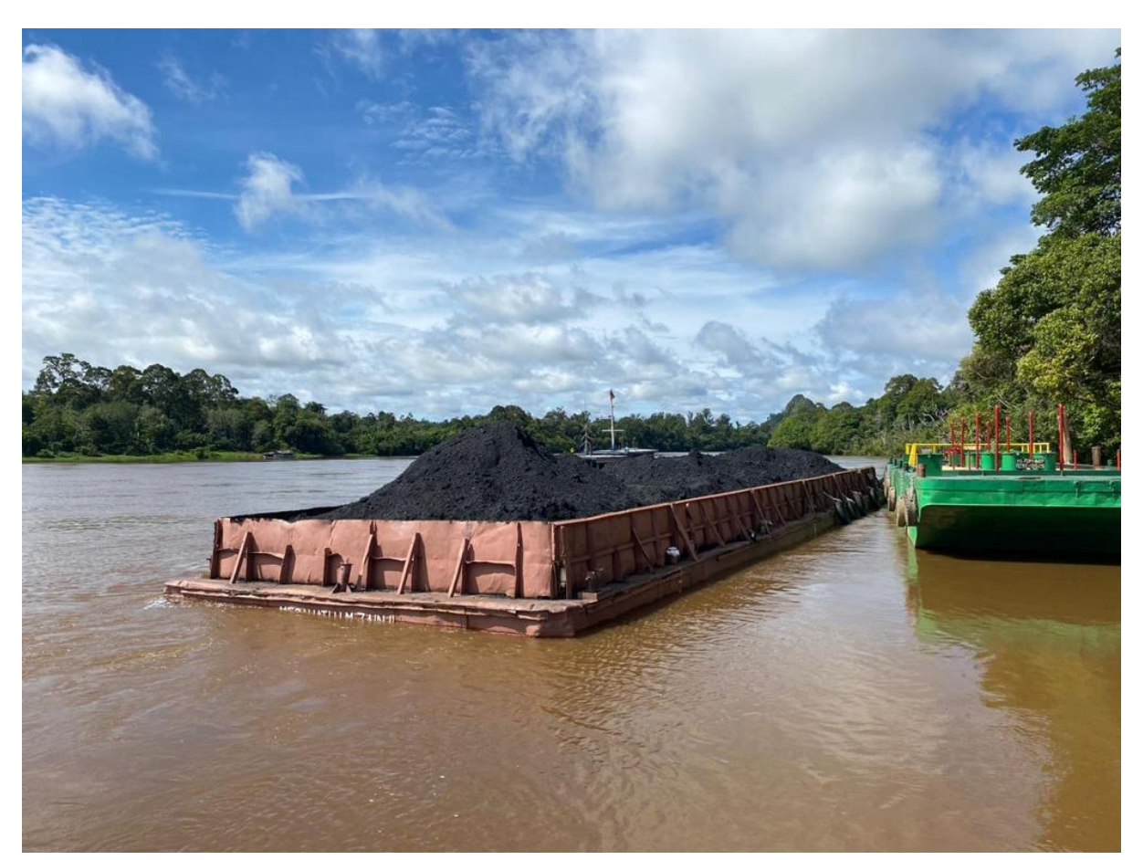
BBM coal being transported via barge