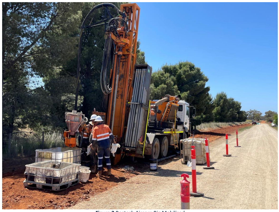
Figure 2 Bostech Aircore Rig Mobilised

This announcement has been approved for release by the Board of Falcon Metals.