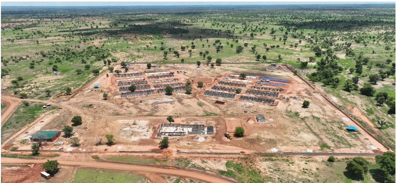
Kiaka main camp area