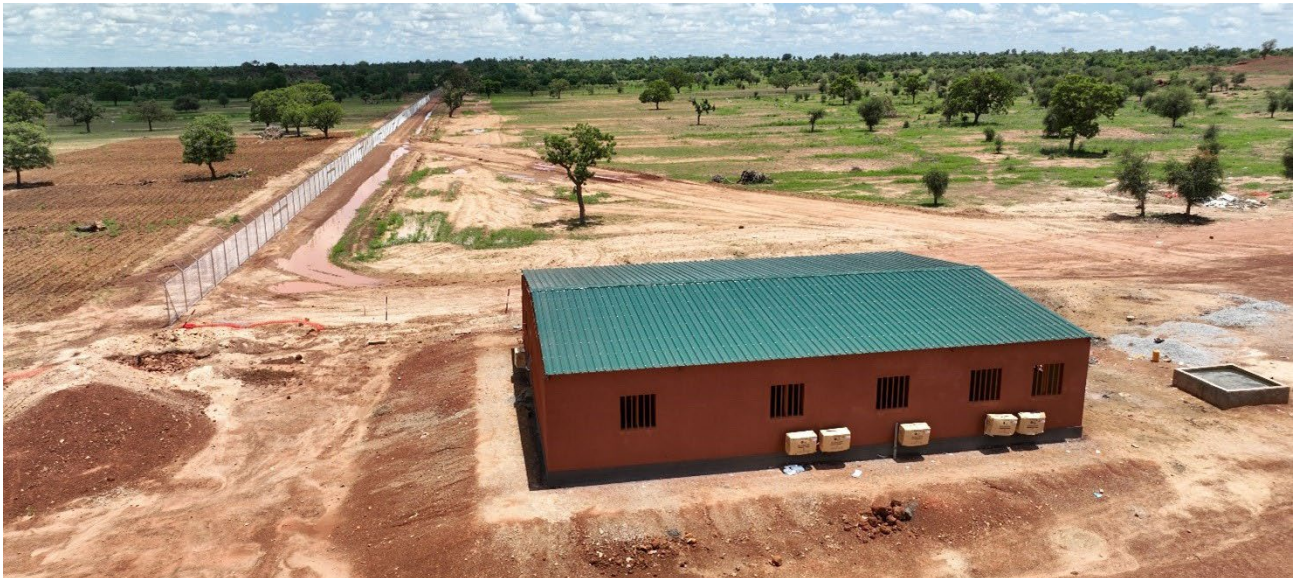
Kiaka Front Gate Area