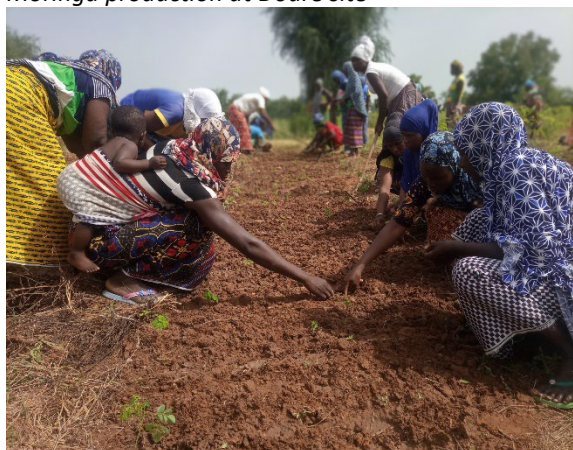
Moringa production at Douré site