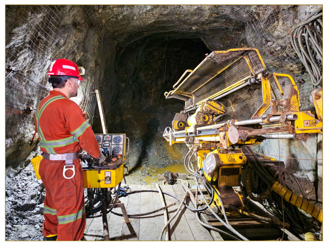
Photograph of the Atlas Copco Diamec U6 drill rig underground on the 55L at the Ming Mine (16 October 2023)

"This means we have two exceptional avenues for resource growth. The drilling is aimed at unlocking these opportunities in a timely manner".