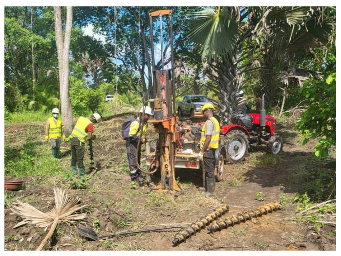
Figure 1: Auger drilling on the Poku Trend, Didievi Project

Following the completion of a 2,000m auger drilling campaign earlier in the year on the 11km Poku Trend soil anomaly, located approximately 2km to the east of the high grade Blaffo Gueto prospect, the Company was pleased to announce results which further confirmed the gold potential across the Didievi Project.