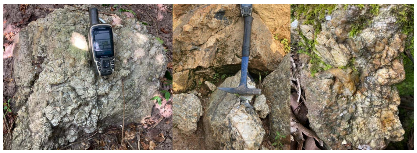
Figures 3, 4 & 5: Various outcropping pegmatites on the Agboville Project

The results from the stream sediment sampling identified two high priority zones of over 150km<sup>2</sup>. Rock chip samples from the recent mapping and sampling have been submitted for assay and the results remain pending.