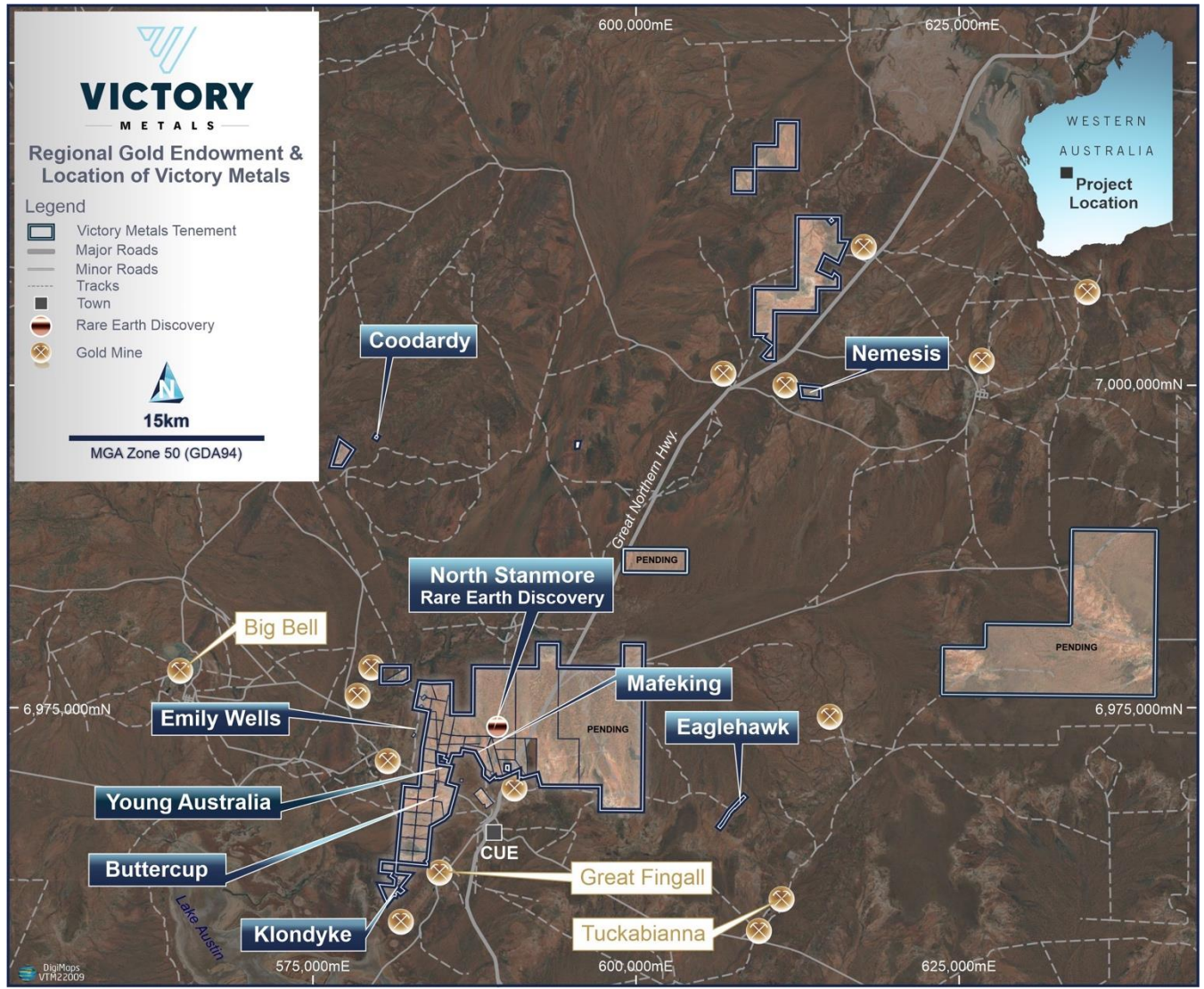
Figure 2. Regional Map showing Victory Metals tenement package and pending tenements.