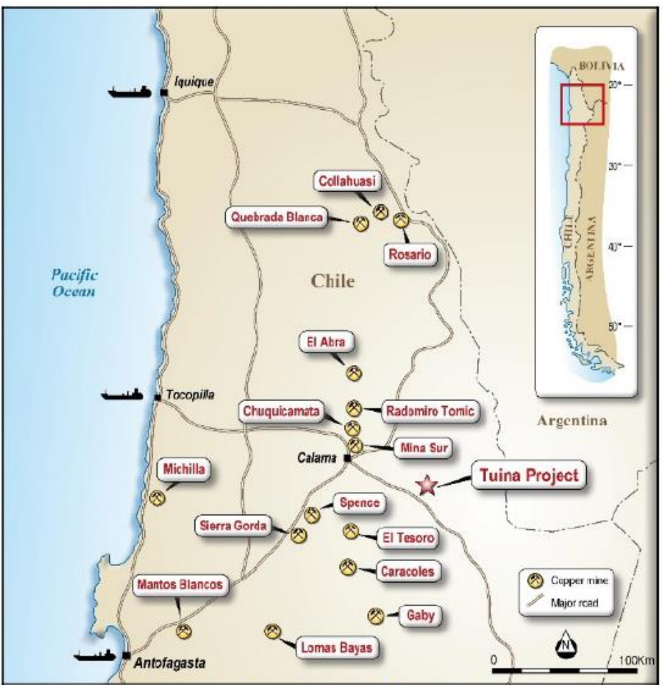
Location of Tuina Project in Chile