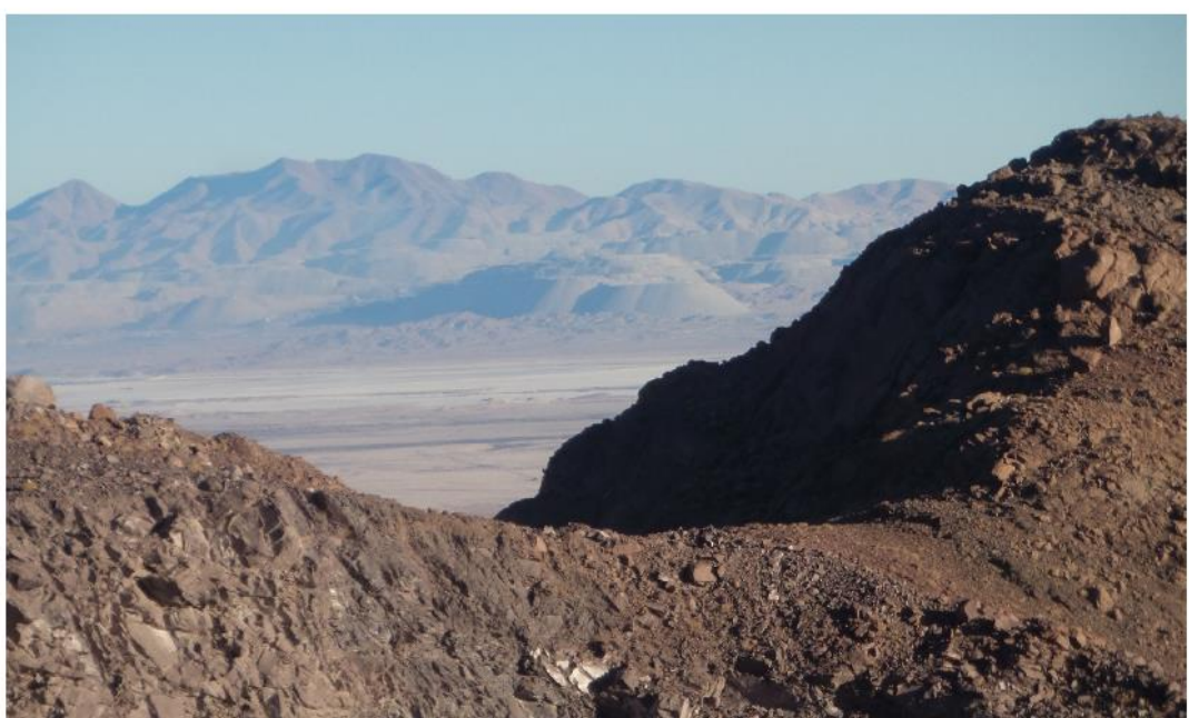
View of Chuquicamata Mine dumps from Tuina