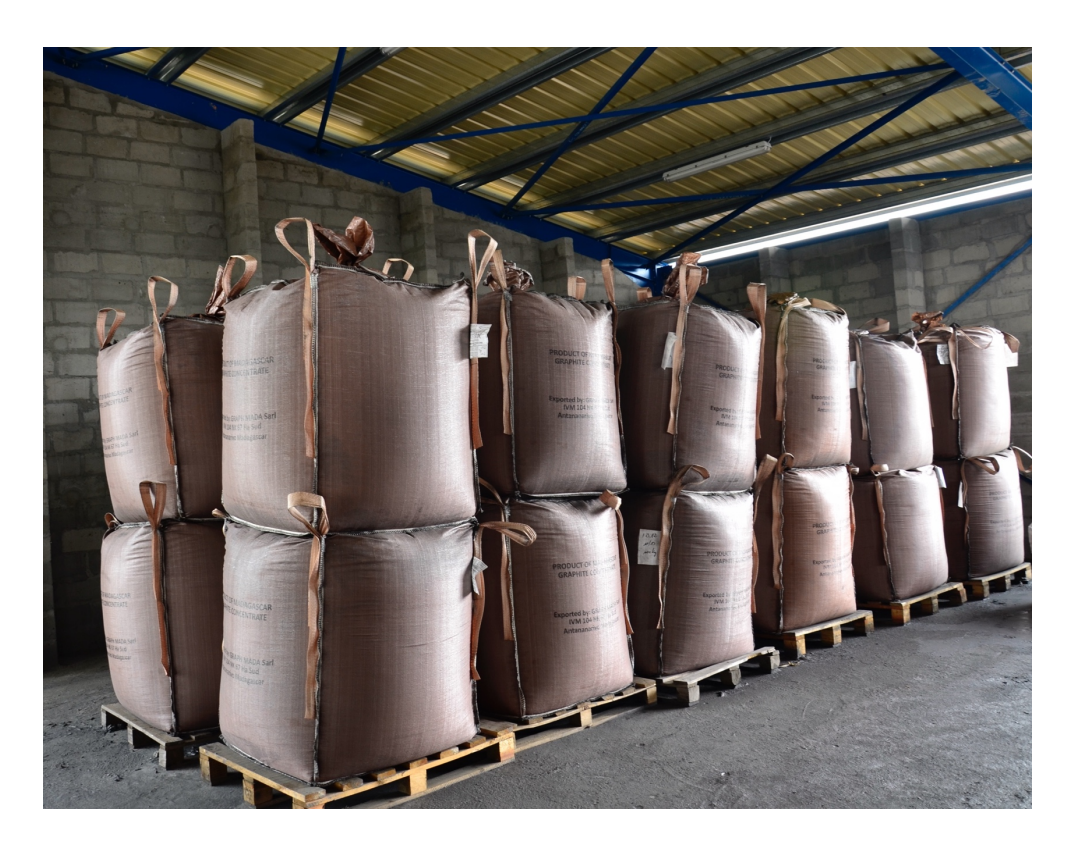
Figure 2: Stage 1 large flake graphite concentrates

As previously announced to ASX, Bass has tabled several exploration and development updates as part of its strategy for developing large scale mining and processing at Graphmada (Stage 2).