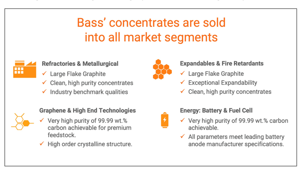
Figure 1: Graphmada's unique product suitable for all market segments.

Bass sits in a unique position to create significant value for shareholders by pursuing the considerable opportunities the emerging advanced materials sector offers. Bass' concentrates are highly suitable for all applications, across all market segments, having sold its graphite concentrates globally.