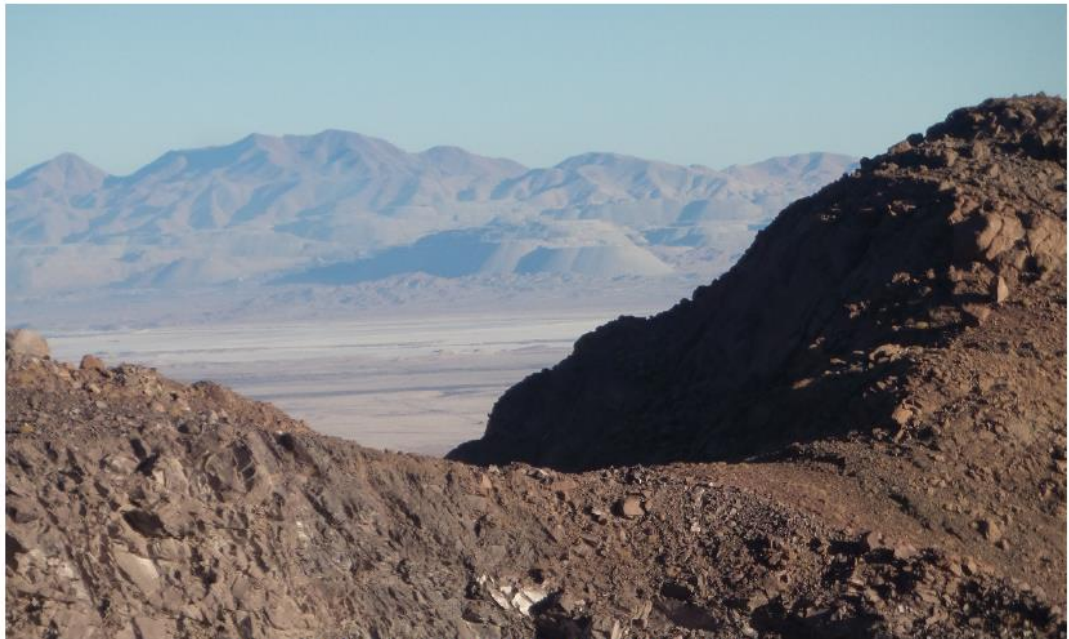
View of Chuquicamata Mine dumps from Tuina