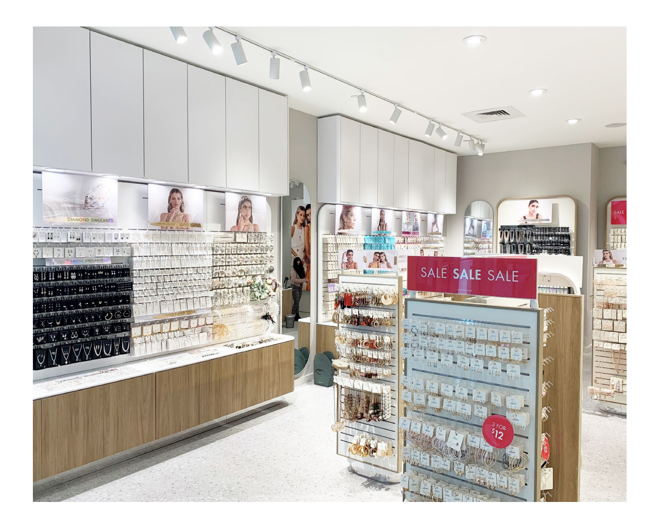
Lovisa Holdings Limited Preliminary Final Report - 2 July 2023

The brand is also developed through the customer in-store experience – on trend product, cleanly merchandised, focused imagery, and the store "look and feel". Stores are located in high foot traffic areas, in high performing centres. The Group's online stores and presence on 3rd party marketplaces operate to service the markets in which the Group operates company-owned stores.