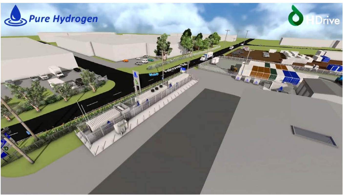
Figure 1: Pure Hydrogen's first micro-hub refuelling site at Archerfield Airport – elevated view

https://purehydrogen.com.au/overview-of-the-archerfield-hydrogen-micro-hub/