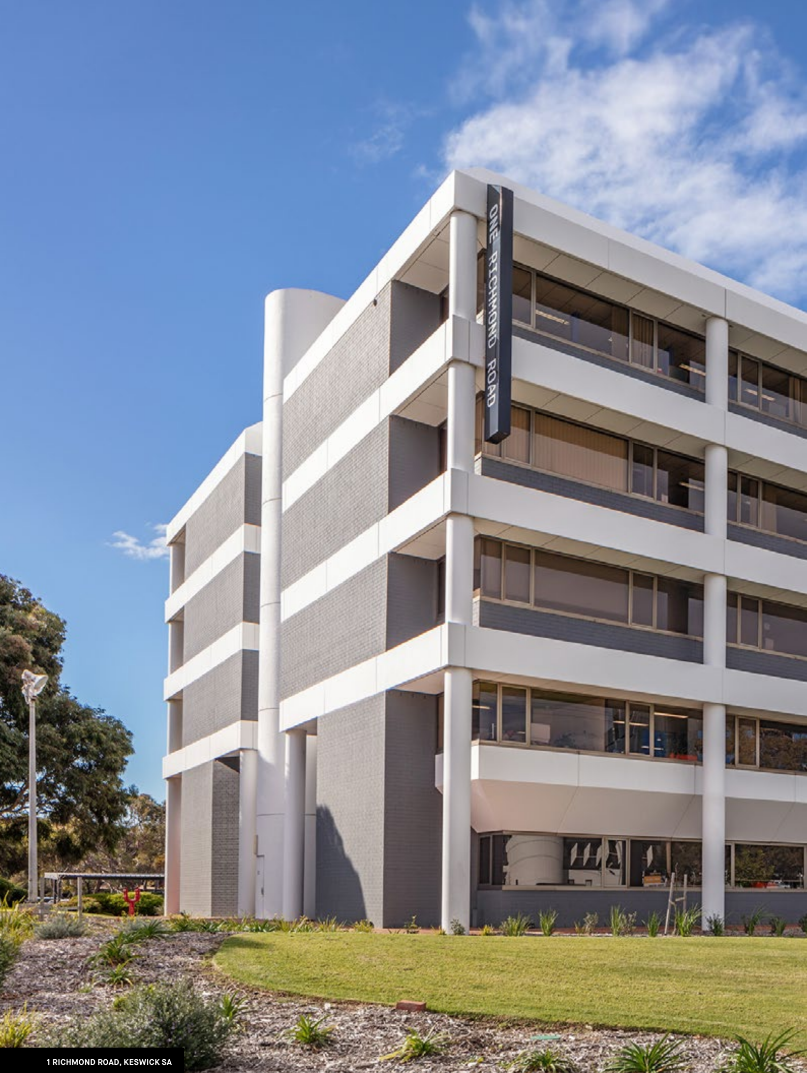
1 RICHMOND ROAD, KESWICK SA