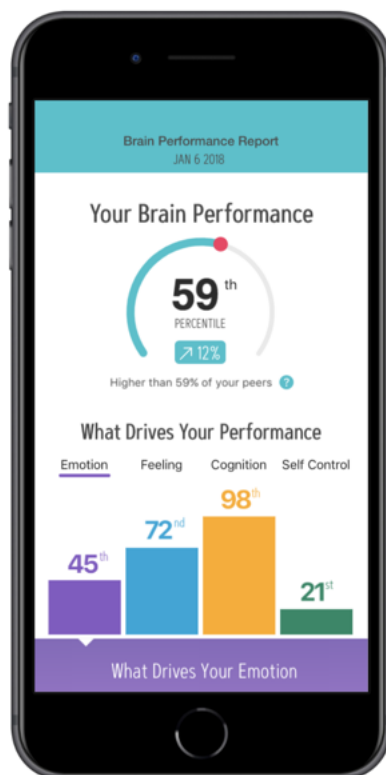
Brain Performance Results - Understanding the Total Brain