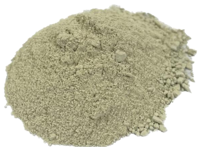
Figure 1. Mixed Rare Earth Carbonate test product produced from North Stanmore

<sup>1</sup> Rare Earth Oxide prices sourced from Strategic Metals Invest, Statistica, Argus and Metal.com.