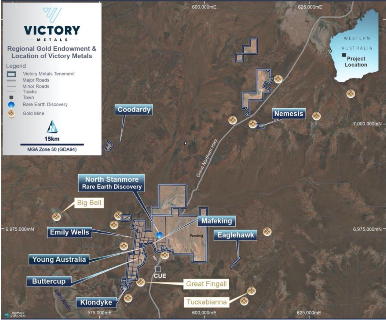
Figure 5. Regional Map showing Victory Metals tenementl package and pending tenements.