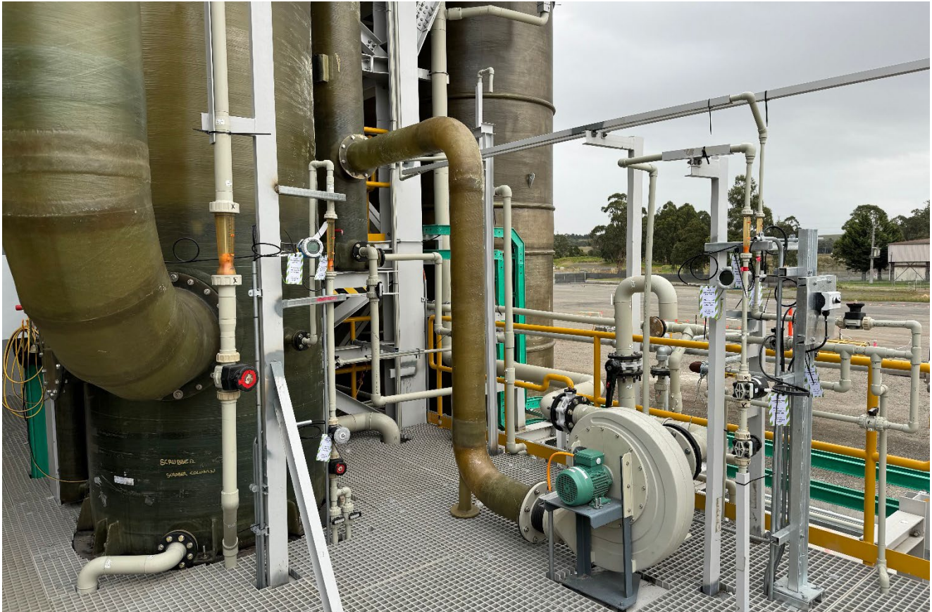
Figure: Spray Roaster construction complete