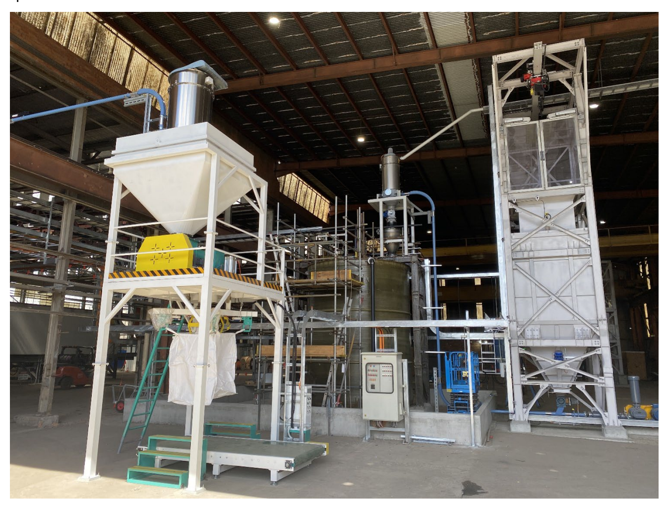
Figure: Magnesium Bagging Plant

The construction and commissioning of the briquetting system, reduction furnace area, the furnace automation and vacuum system is the second phase of the plant to be completed and commissioned. Magnesium metal is targeted for Q3 2024. More information will be provided in subsequent project updates.