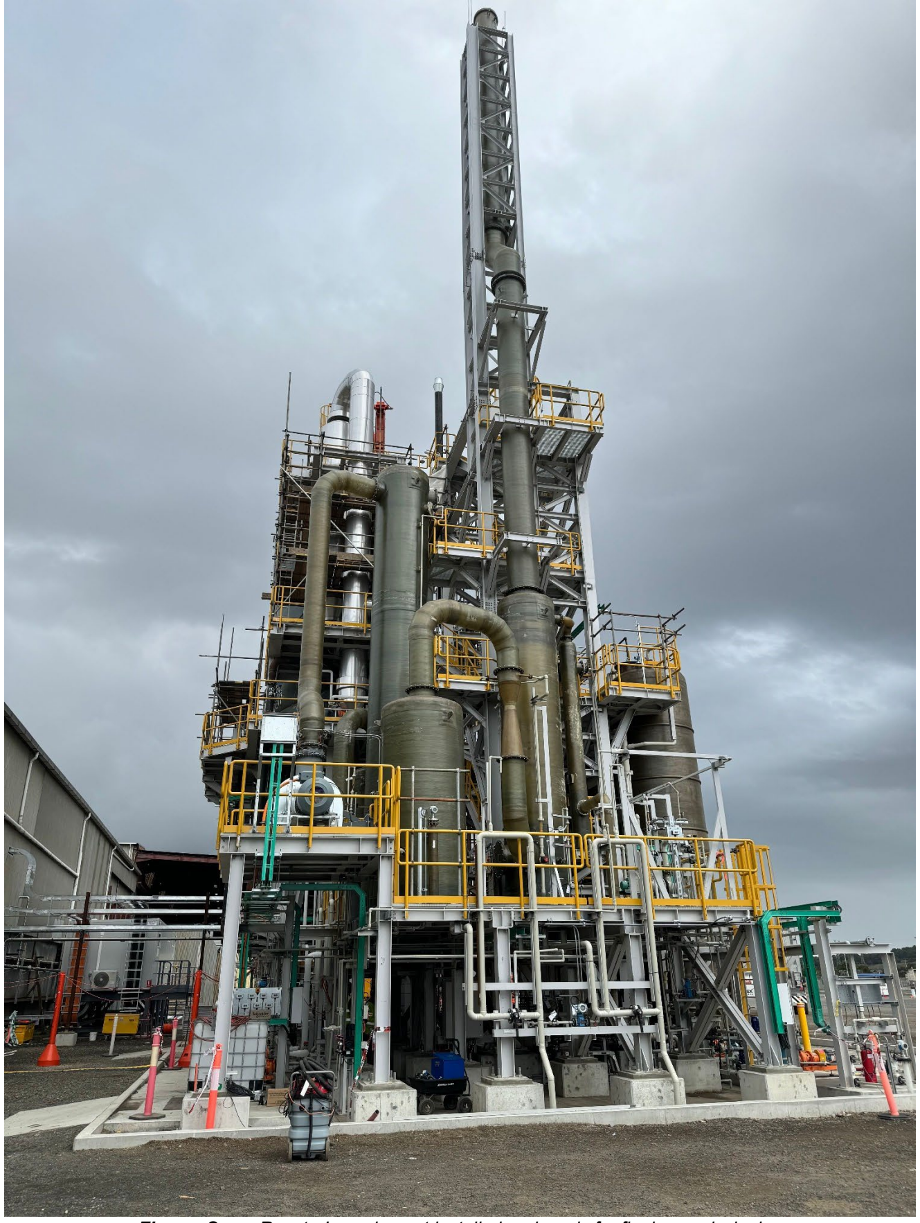
Figure: Spray Roaster's equipment installed and ready for final commissioning