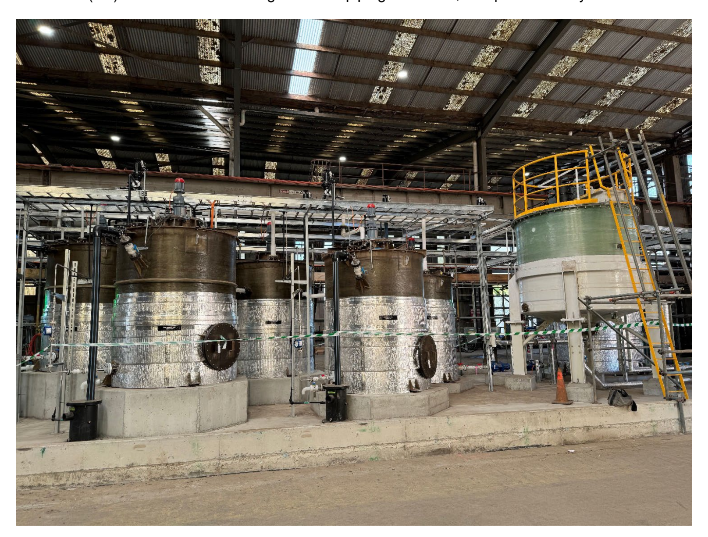
Figure: Hydromet area construction complete and commissioned

Traralgon Industries, another local Latrobe Valley company has completed the installation of Personal Protection (PP) insulation and cladding of certain piping and tanks, for operator safety.