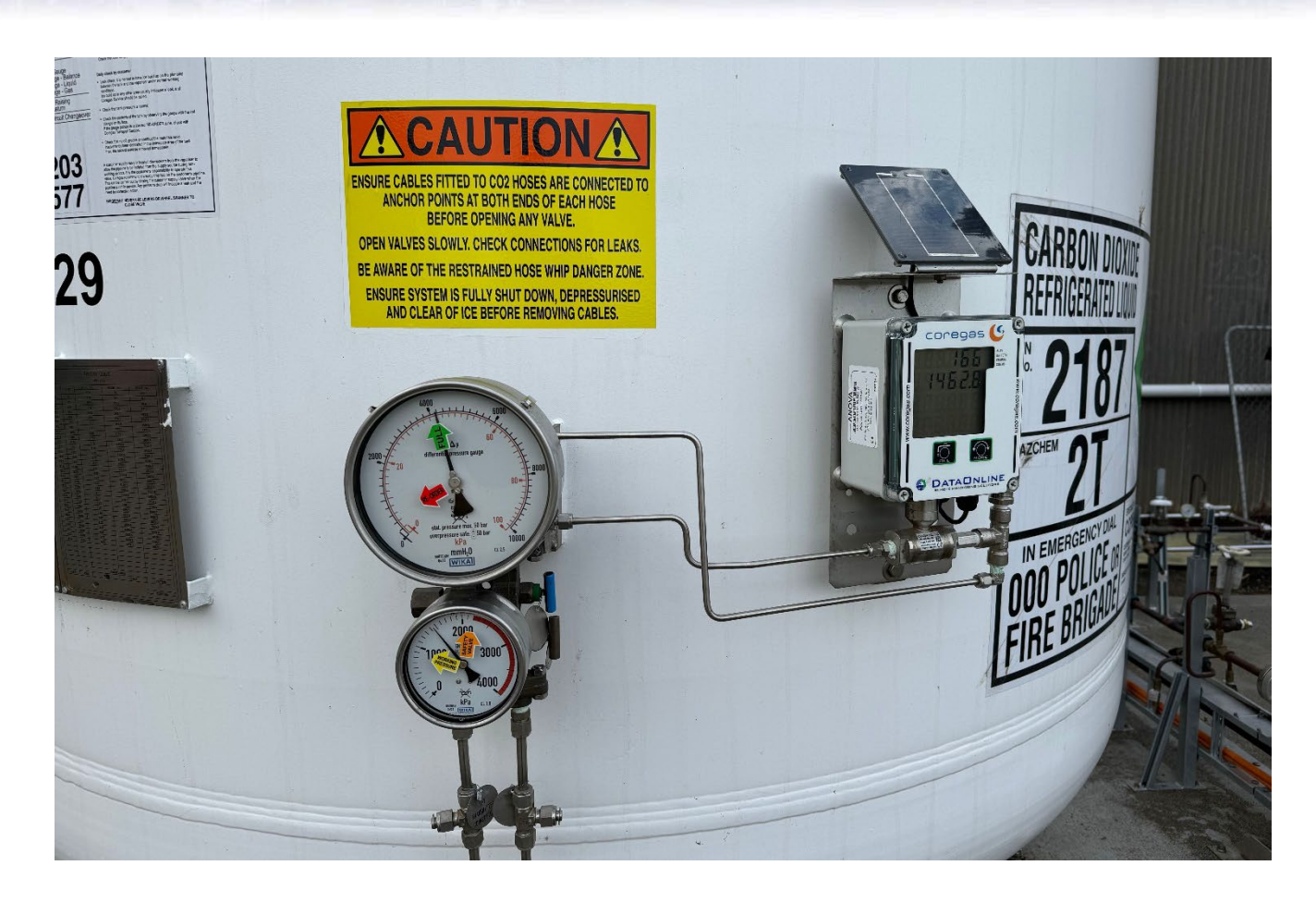
Figure: Coregas Oxygen and Carbon Dioxide tanks operational