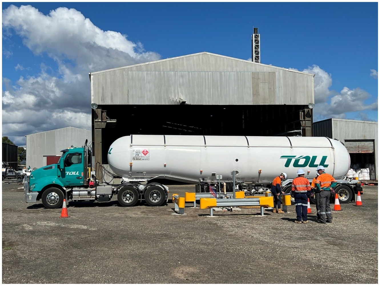
Figure: Origin team successfully commissioning LPG tank and receipt of the first LPG delivery