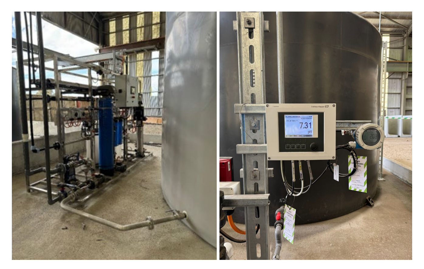
Figure: RO Plant and Raw Water equipment operational

With the conclusion of the remaining construction tasks, notably the resolution of major punch list items, construction resources have now been allocated to the commissioning team. Construction efforts will continue, focusing on the completion of minor punch list closeout activities and initiating planning for transitioning to the next phase of the project, which involves the completion of magnesium metal.