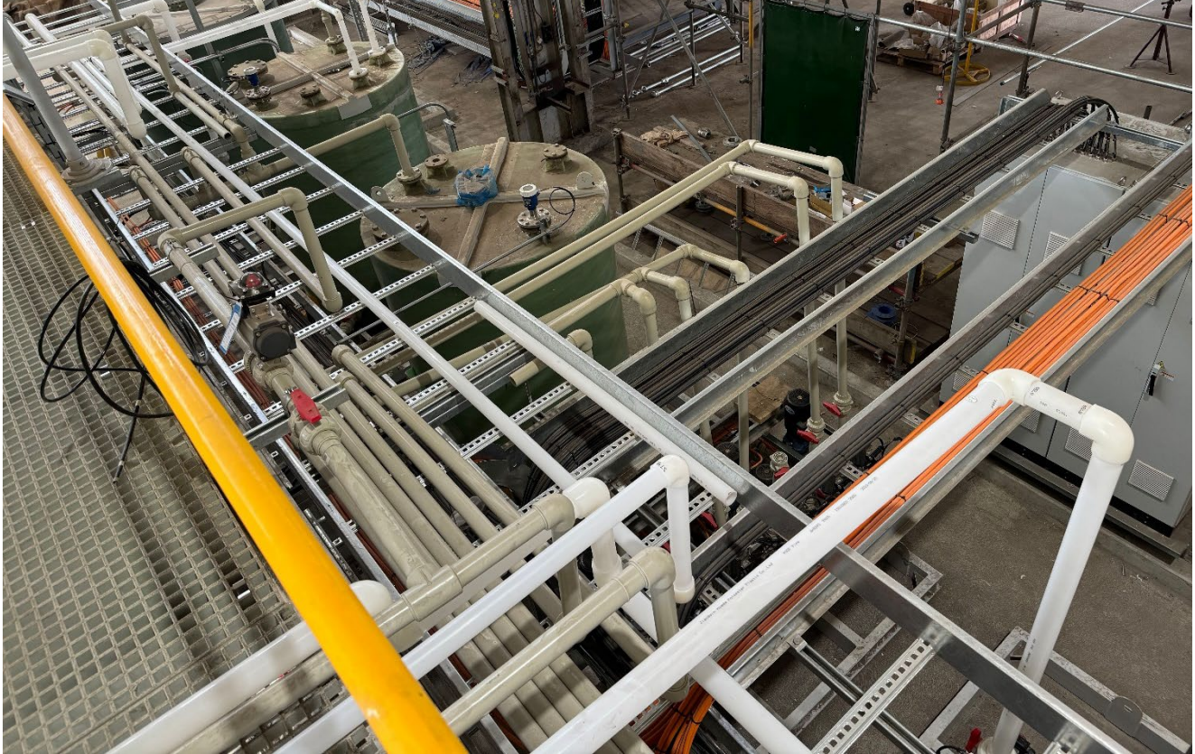
Figure: Filtration area complete with all piping, hydraulics and electrics installed