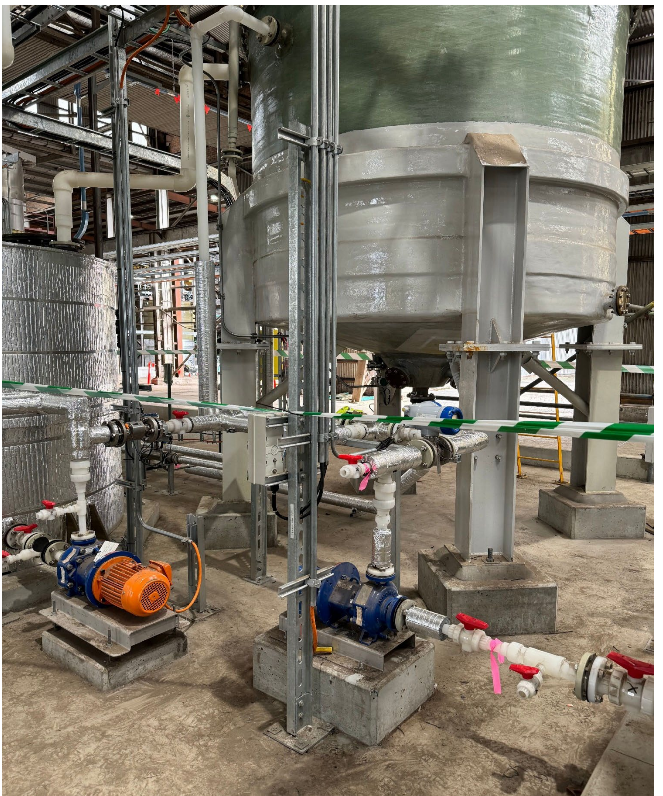
Figure: Hydromet piping, and insulation completed and commissioned.

valves, rewiring control hardware, and updating control logic sequencing. This considerable effort by the team is very close to completion and the first of three filters is now fully operational and ready.