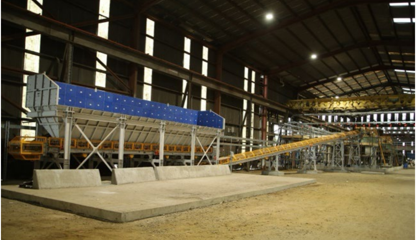
Figure: Magnesite Hopper, Bag Breaker, and Fly Ash areas ready for operations