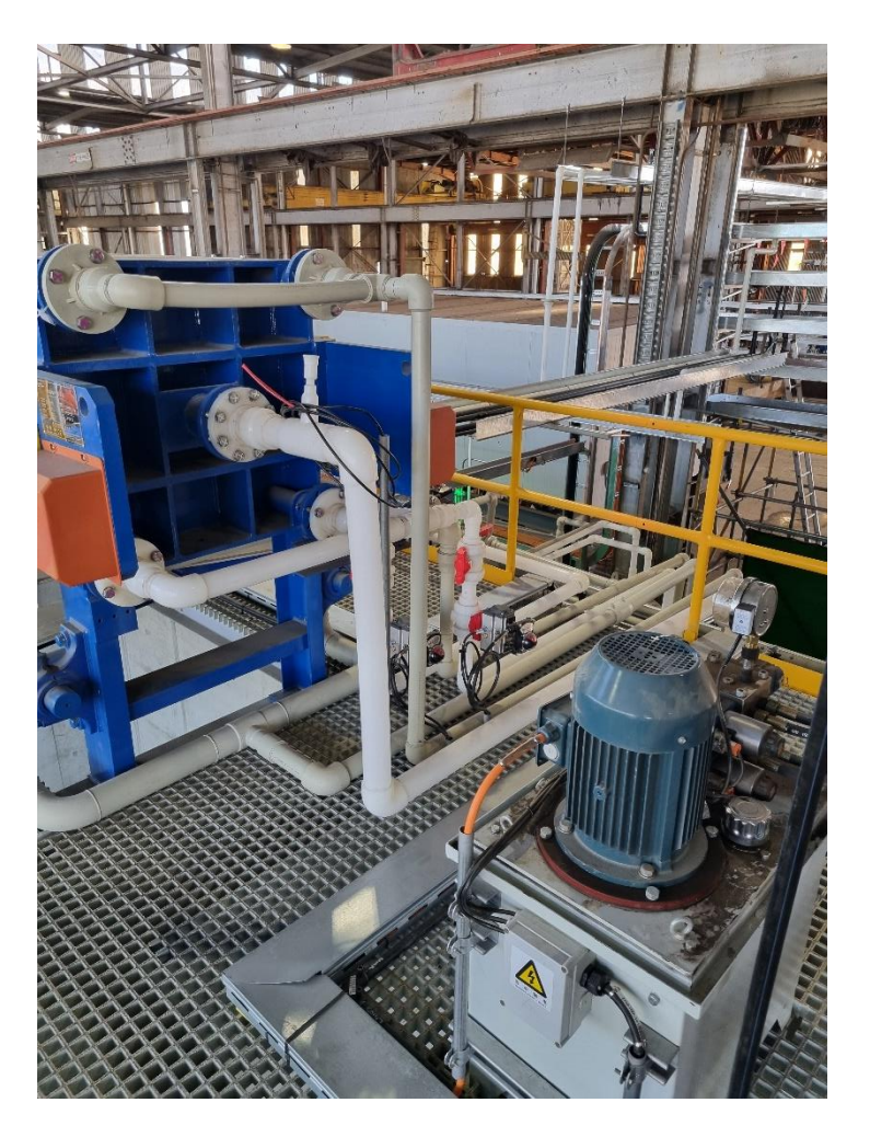
Figure: Filtration piping, hydraulics and electrics installed