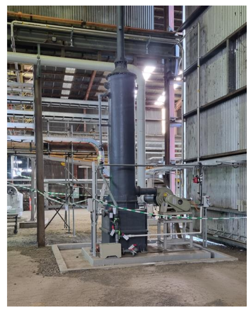
Figure: Acid Scrubber area under commissioning