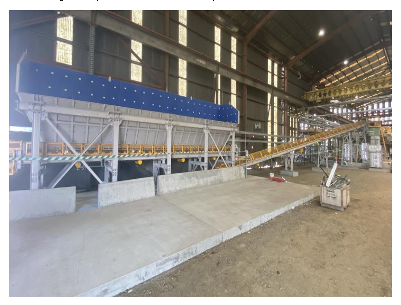
Figure: Ash Handling area complete

The ash handling area is complete, commissioned and now under the control of the commissioning team, awaiting the completion of the remainder of the plant.