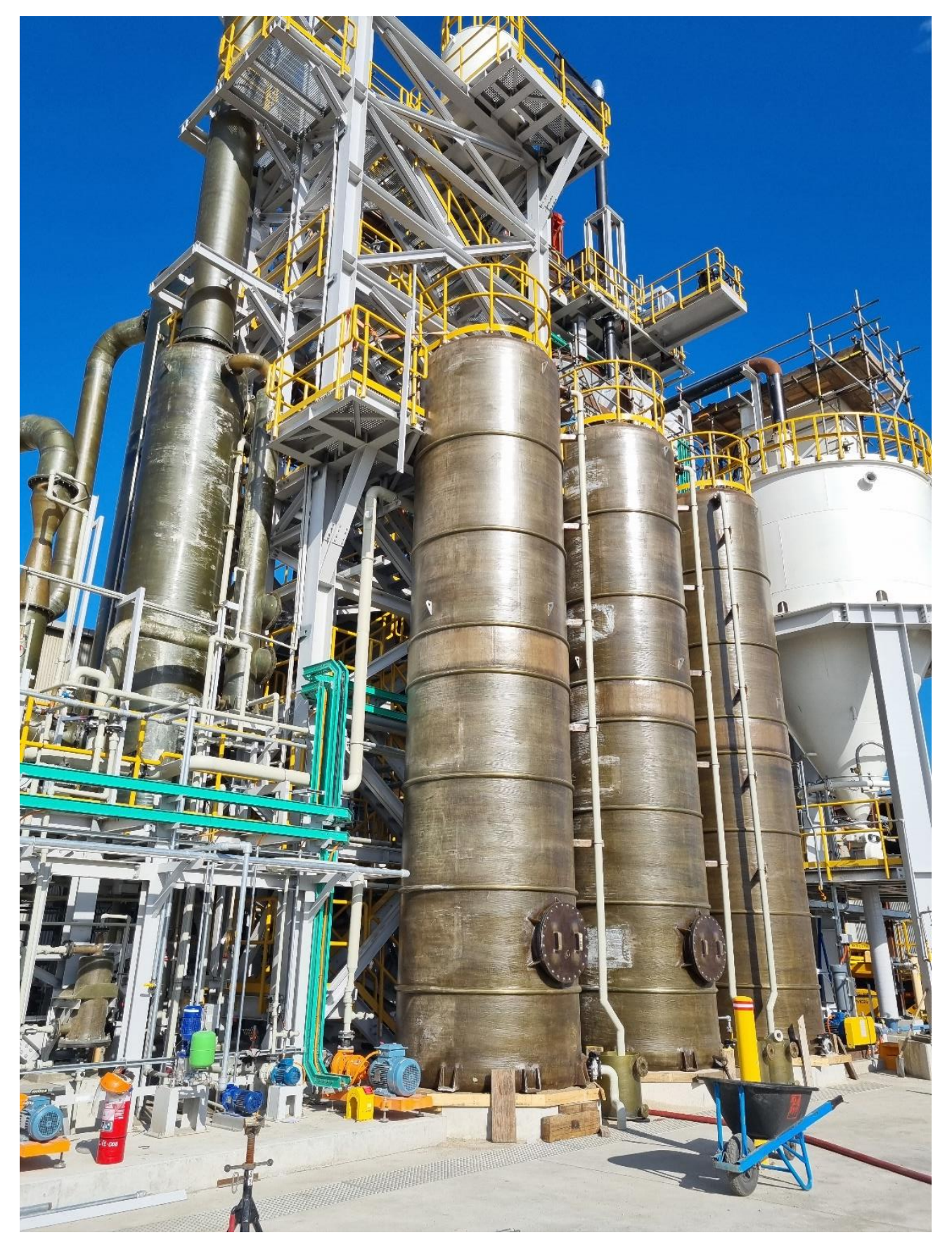
Figure: Spray Roaster mechanical and piping complete