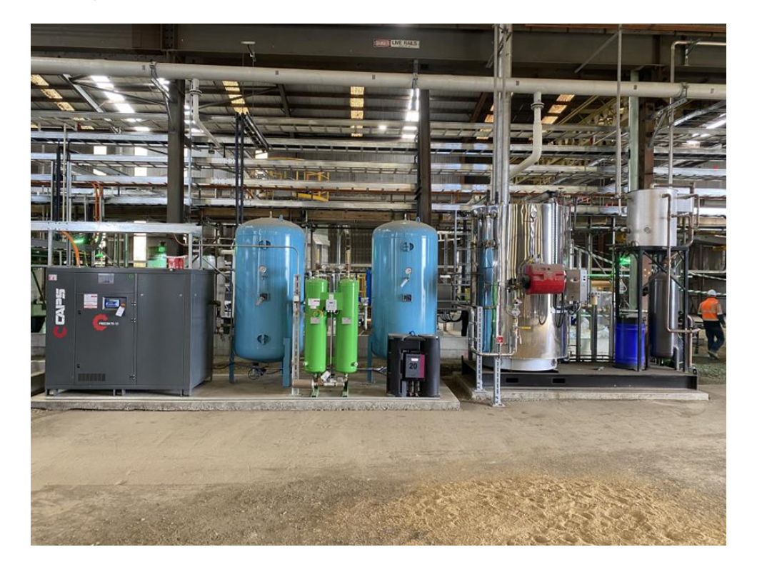
Figure: Process Air, Instrument Air undergoing commissioning

The air systems are complete and being commissioned. The startup steam boiler will be commissioned with vendor support in the first week in April once LPG is available. The LPG tank is complete and ready for filling with LPG and commissioning once the Dangerous Goods permit arrives from WorkSafe Victoria, which is expected this week.