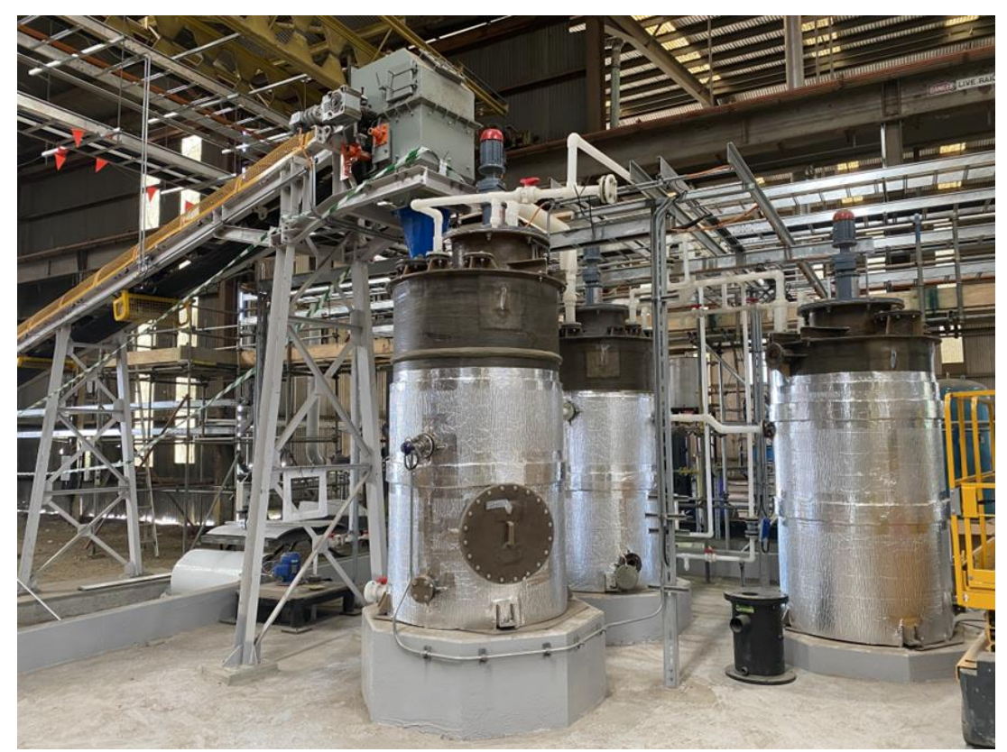
Figure: Acid Leach area complete