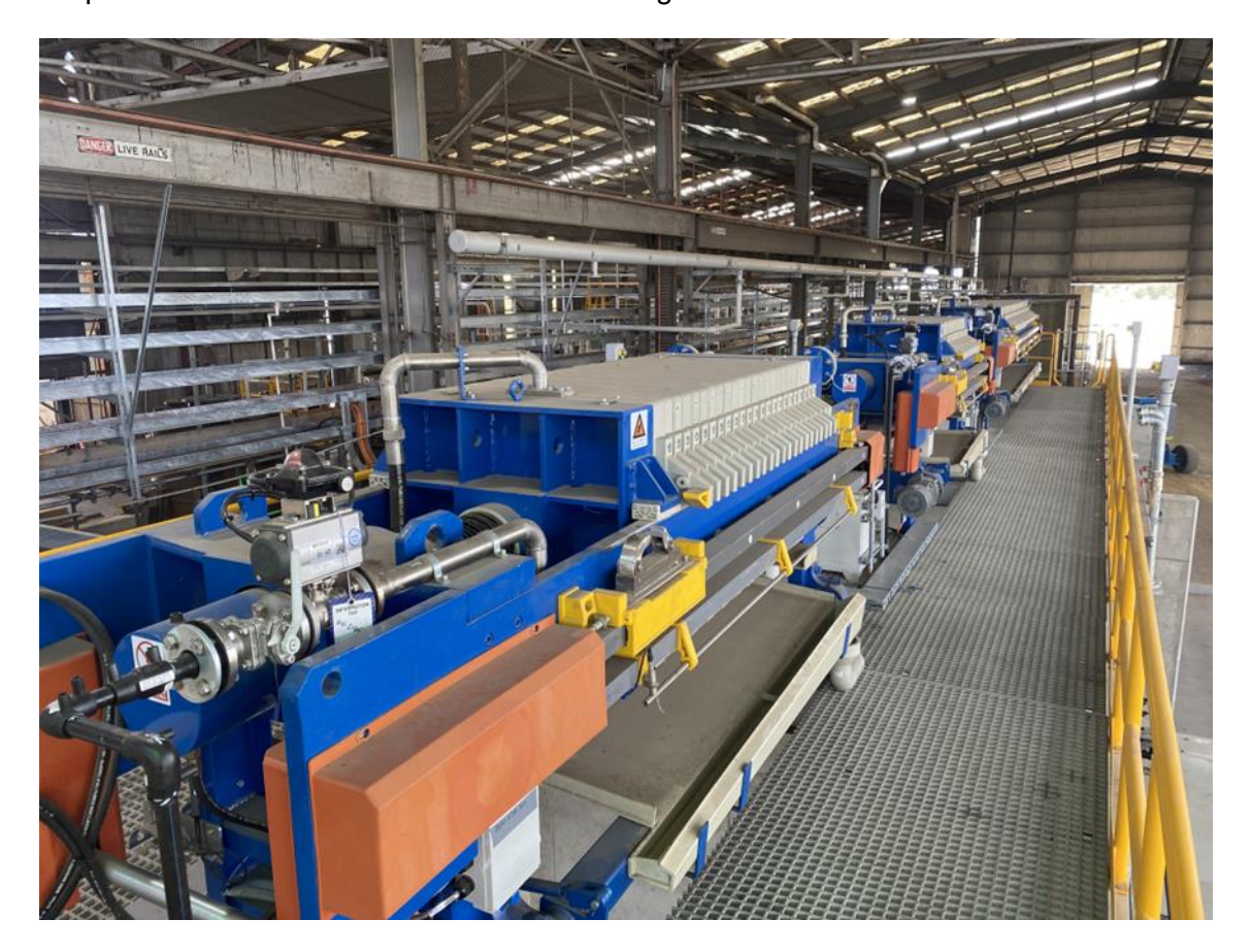
Figure: Filtration area complete with all piping, hydraulics and electrics installed

The filtration area is complete and undergoing pre-commissioning. The filter programmable logic controllers (PLC's) arrived from the vendor without the full code to operate the filters. The code is being rewritten by the commissioning team to allow testing of the filter sequence and ensure it is operational. Once complete this area will move into commissioning control this week.