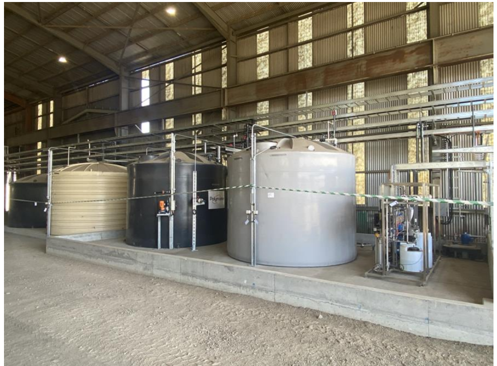
Figure: Water systems operational

The water areas, Process Water, Raw Water, Potable Water and Water Treatment have finished commissioning and are now operational. The water systems are now being used to provide water for water filling of tanks and water runs through pumps and piping to confirm system integrity.