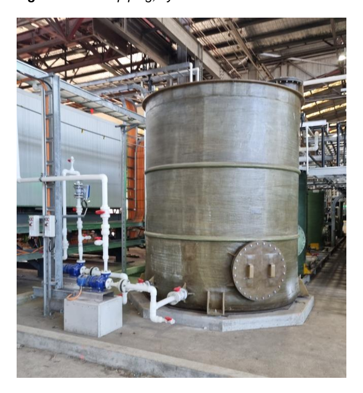
Figure: Magnesium holding tank complete