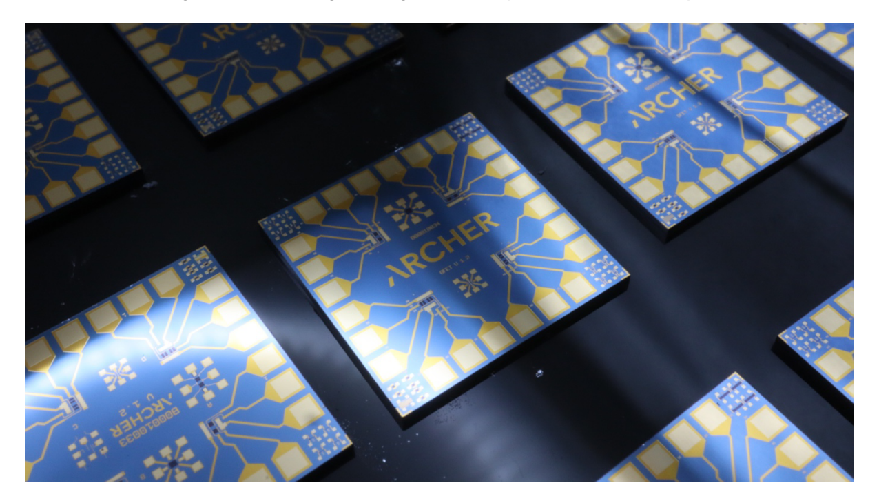
Image 2. Archer's advanced gFET chips for advanced biosensing diced from the whole four-inch wafer fabricated in a commercial foundry.

During the Quarter, Archer announced that its advanced gFET design had been sent to a commercial foundry partner in the Netherlands for a whole four-inch wafer run for validation. Archer Materials' commercial foundry partner in the Netherlands validated its advanced biochip gFET design by successfully manufacturing the chips (Image 2). The whole wafer fabrication of the gFET device design is a significant step towards industrial production.