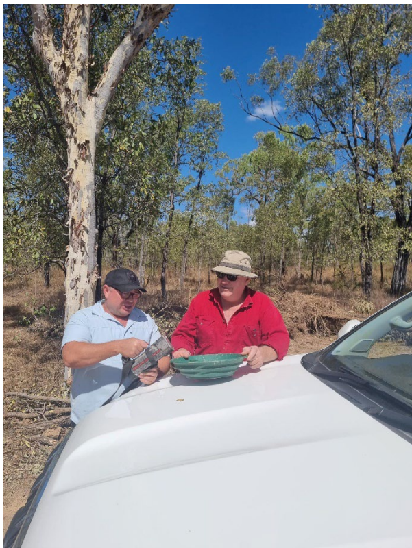
Figure 2 Ark Directors accessing drill samples with the Scintillometer