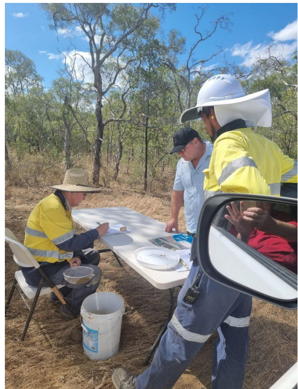
Figure 3 Ark Geologists logging and accessing samples from the air core rig.